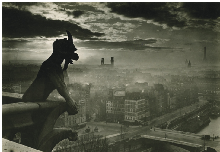
Notre Dame Gargoyle, circa 1930s

This will be an extremely small group— limited to six photographers —and everyone can expect to receive individual attention and photographic encouragement!