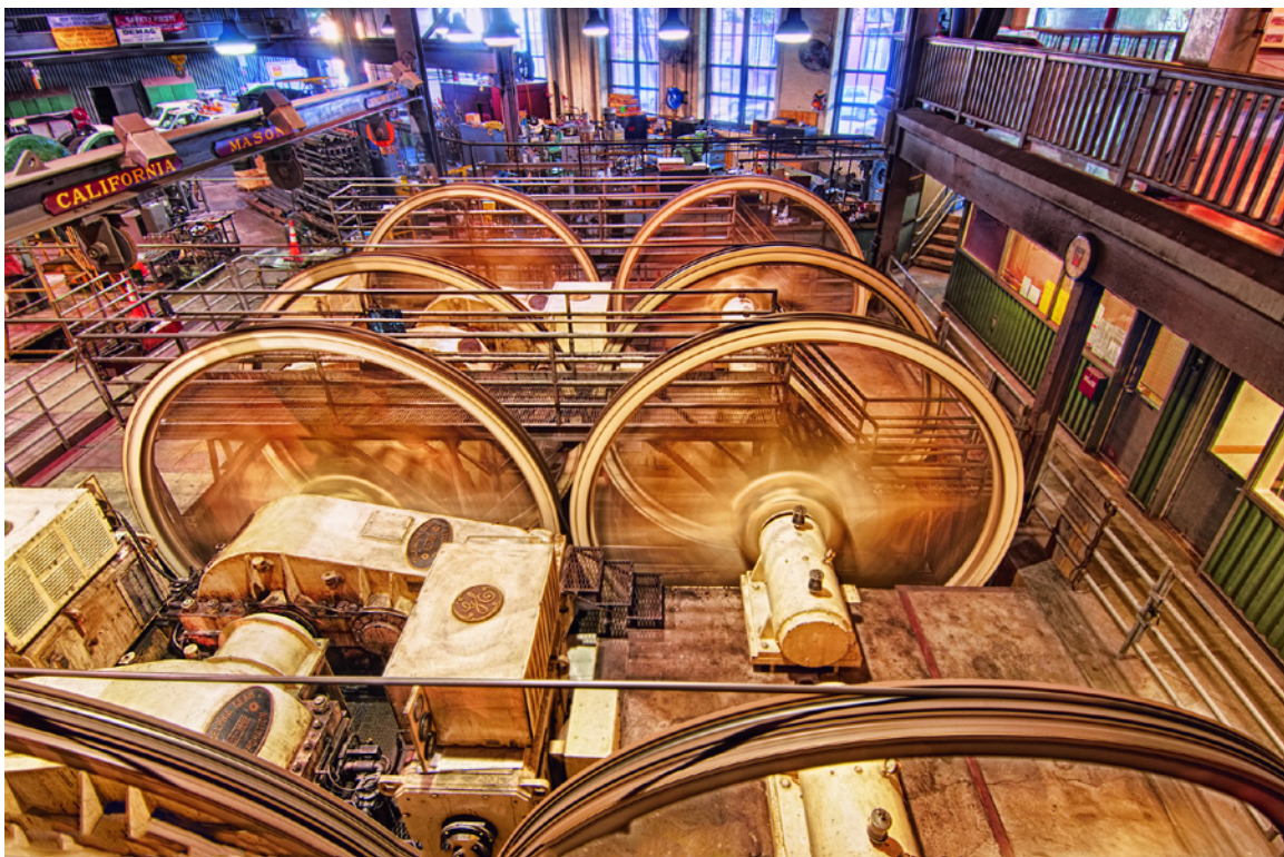
Cable Car Power